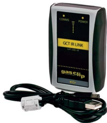
GCT IR Link

10' Sampling Hose 10 Additional Filters; 5 Hydrophobic and 5 Particulate Stainless Steel Diffusion Stone