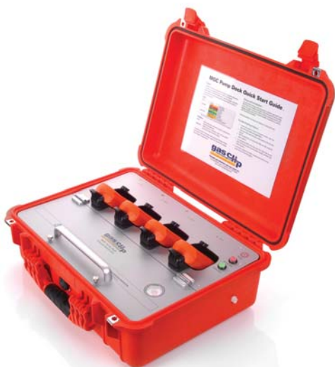
MGC Pump Dock

Size 5.7 x 3.0 x 1.5 in. (147 x 78 x 38.3 mm.) Weight 12.4 oz. (352g) Temperature -4° to +122°F (-20° to +50°C) Humidity 5% to 100% RH (non-condensing) Battery Life 5 days continuous Pellistor: 30 hours continuous Charge Time 4 - 6 hours Alarms Visual, Vibrating, Audible (minimum 95 dB) Low, High, STEL, TWA and OL (Over Limit), Pump LEDs 4 red alarm bar LEDs Yellow backlight (activated on button press) Red backlight (activated on alarm condition) Yellow Maintenance Notification LED Display Alphanumeric Liquid Crystal Display (LCD) Logs 25 Bump tests 25 Events 25 Calibrations Continuous 1 second data logging (> 2 month typical capacity) Tests Full function self-test upon activation Sensors, battery and circuitry conditions